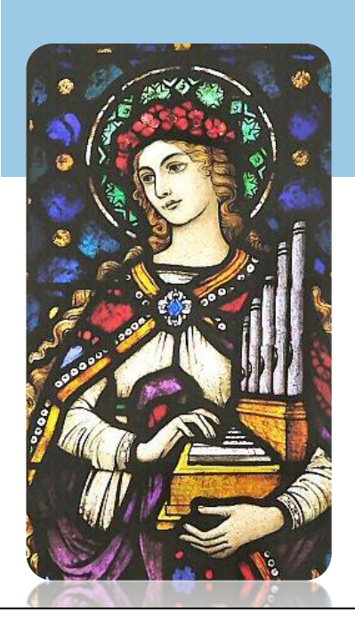
St. Cecilia, pray for us!